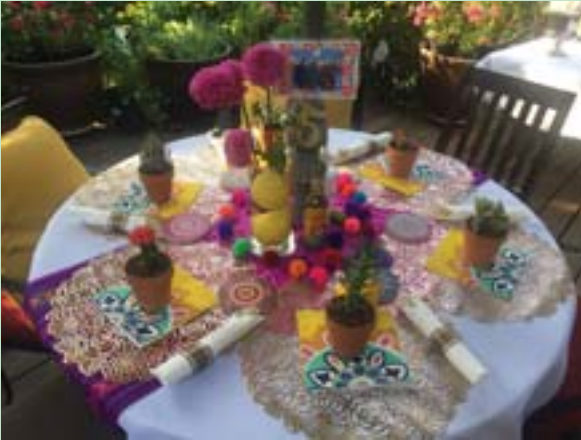
A round table with dahlias and lemons centerpiece and colorful table décor.